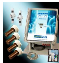
CS-300 / 300,000 gals