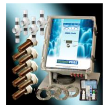
CS-600 / 600,000 gals