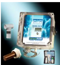
CS-75 / 75,000 gals