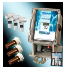
CS-225 / 225,000 gals