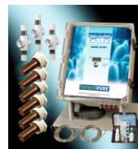
CS-450 / 450,000 gals