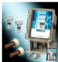
CS-150 / 150,000 gals